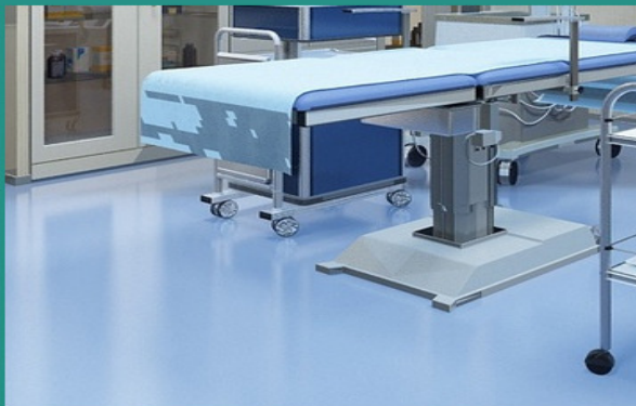
Hospital operating room